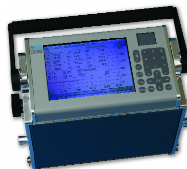
The TRP-2 can be used with the CIRAS-2 Portable, Differential CO 2 & H 2 O Gas Analyzer

PP Systems is continuously updating its products and reserves the right to amend product specifications without notice.