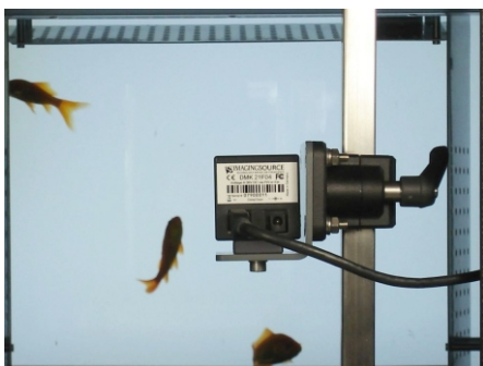
aquarium and camera

The bbe software contains all the components necessary to operate the toximeter. The 17" touchscreen panel provides a graphic display of the measured results with live, real-time images, offline viewing and an intuitive user interface. Fish tank, tubes and connectors are easily accessible for low-maintenance.